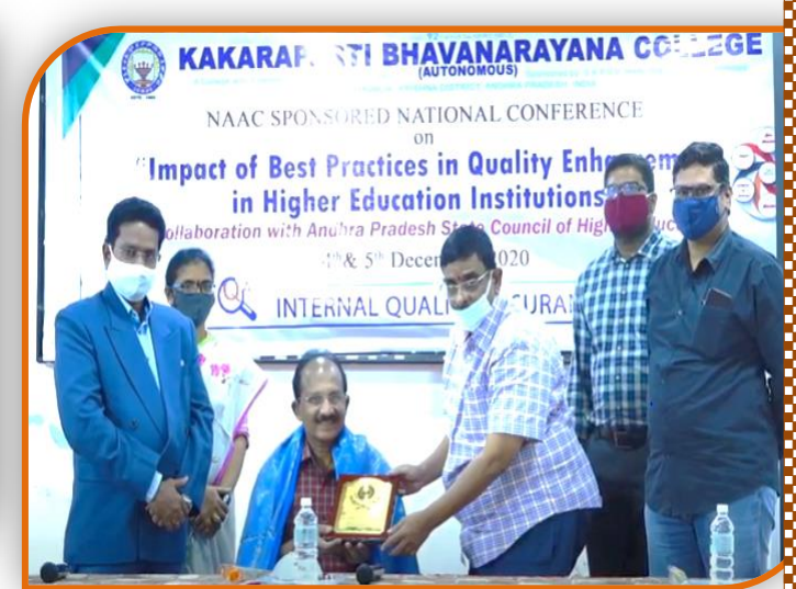
Felicitation to the Chief Guest