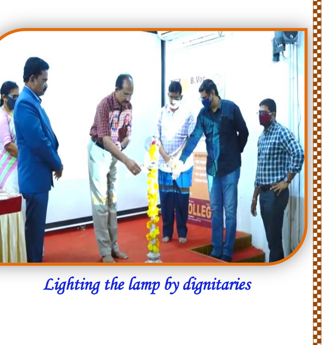
Lighting the lamp by dignitaries