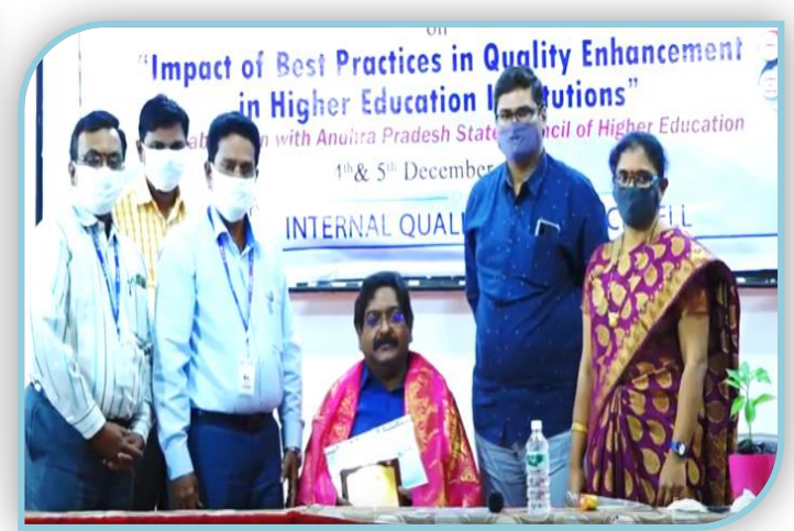
Felicitation to the Chief Guest